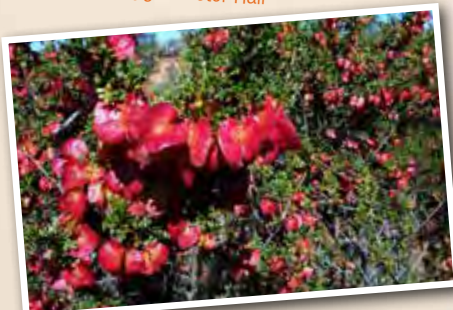
Dodonaea microzyga