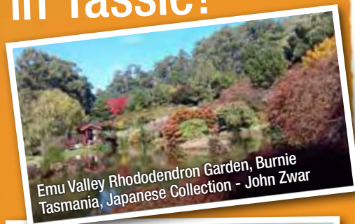
Emu Valley Rhododendron Garden, Burnie Tasmania, Japanese Collection - John Zwar