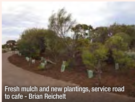
Fresh mulch and new plantings, service road to cafe

The Arid Explorers Garden received an upgrade to its plantings, wooden structures (seats, bridges, shelters) have been oiled to increase their life expectancy and a drinking fountain has also been installed.