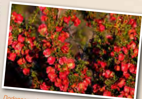
Dodonaea microzyga