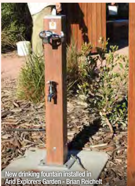
New drinking fountain installed in Arid Explorers Garden - Brian Reichelt

The main entrance to the Garden on the Stuart Highway has had an upgrade to the old myall post fence as it had been damaged by kangaroos breaking it down to gain entry to the Garden.