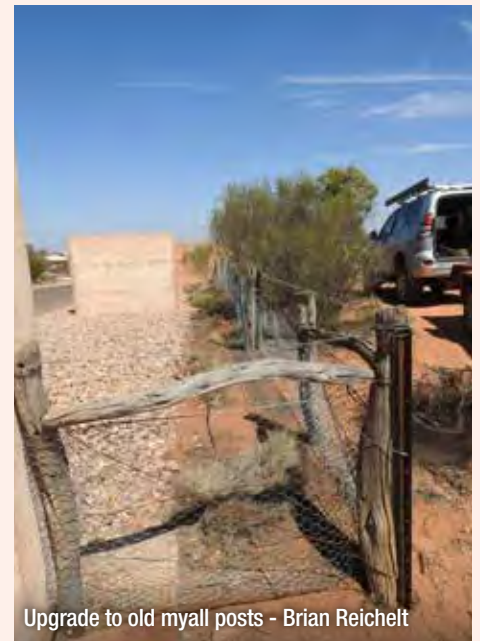
Upgrade to old myall posts - Brian Reichelt

The main entrance to the Garden on the Stuart Highway has had an upgrade to the old myall post fence as it had been damaged by kangaroos breaking it down to gain entry to the Garden.