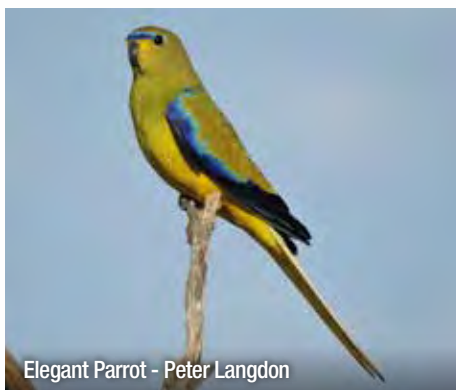
Elegant Parrot - Peter Langdon

A solitary male Australian Bustard ( Ardeotis australis ) was sighted near the water-treatment plant on 9th April 2019, the only one of that species seen in the Garden for some time.