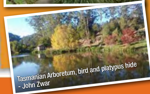
Tasmanian Arboretum, bird and platypus hide