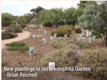
New plantings in old Eremophila Garden - Brian Reichelt

Volunteers and staff have been very busy planting to replace those plants that have been lost over summer, and we have also been mulching areas to assist in saving on water evaporation and to make the Garden more appealing to the visitors. The areas to gain the most attention have been the Highlights Walk, old Eremophila Garden closest to the café, the service road leading into the café, and the Arid Explorers Garden; approximately 200 plants have been planted during this time.