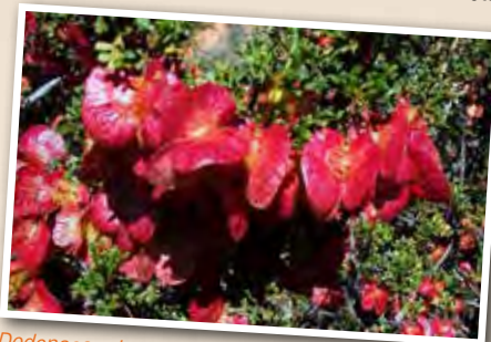
Dodonaea microzyga - Peter Hall

Dodonaea microzyga or Brilliant Hop-bush is a very ornamental species and occurs over a large area of Australia. Microzyga means small leaflets.