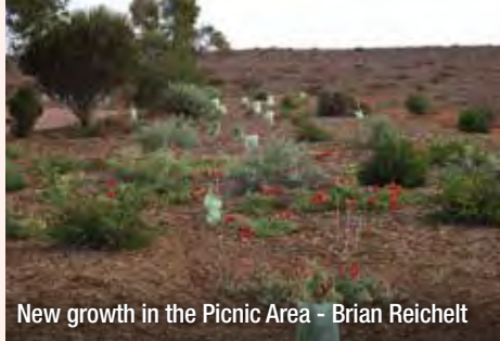
New growth in the Picnic Area - Brian Reichelt

It is amazing to see the growth that has occurred on the plantings around the picnic area. It really shows that the arid zone native plants love the heat and will grow fast provided they have water.