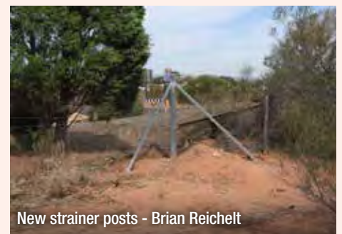
New strainer posts - Brian Reichelt

As mentioned in the last Newsletter commencement of the next stage of the feral proof boundary was on hold until the weather cooled, and as this has occurred, preliminary works have commenced with the upgrading of the strainer posts at the entrance to the Boardwalk lookout on the Stuart Highway and the installing of two other strainer points for the new fence. It is anticipated that construction of the 1 kilometre of fence will commence late April. Once completed this will be approximately half of the boundary fence completed.