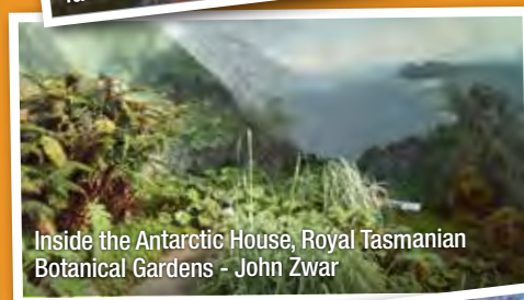
Inside the Antarctic House, Royal Tasmanian Botanical Gardens