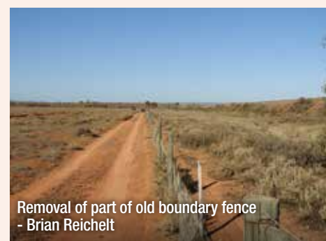
Removal of part of old boundary fence - Brian Reichelt

Thanks to a generous donation of $29,892 from the Friends, $1,000 from Peter and Ronda Hall, $200 Shirley Moy, $200 Port Augusta Caravan Club, $350 from Augusta Automall, and $4,000 from the Garden budget we have purchased fencing materials to build a new feral proof fence on the northern boundary of the Garden. Friends and Staff are busily dismantling the old fence ready for the contractor to install the new fence. Completion of this section is proposed by the end of October. It is proposed that the Friends will raise funds to complete the last 6 kilometres of fence by the end of 2019. If you would like to assist with this project donations will be gratefully accepted, as a total of around $70,000 is needed to complete the project. Your continued support by becoming a Friend and making donations will continue to assist in the growth and promotion of our wonderful Garden.