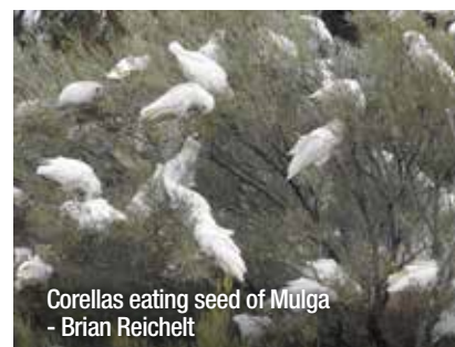
Corellas eating seed of Mulga - Brian Reichelt