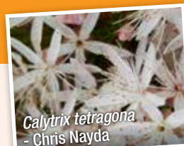
Calytrix tetragona - Chris Nayda

With totals for the three remaining months of 2018 yet to come in the visitor numbers are looking very promising: 86441 so far. With 25000+ anticipated for Oct Nov Dec together, numbers may reach 111000 or more.