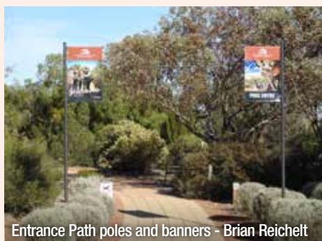
Entrance Path poles and banners - Brian Reichelt

As mentioned in the last newsletter kangaroos have become a problem in the Garden due to the extremely dry year, but on the plus side the kangaroos have virtually eaten all of the wild turnip that grew this year (a blessing in disguise) which certainly saved the Volunteers a lot of time weeding. Volunteers and Staff installed two poles and banners at the beginning of the entrance path to the Garden to welcome visitors. The modified poles came from the now closed Homestead Park and were part of the overland telegraph display; and the banners were purchased by the Friends. It is planned to install up to three more along the entrance path in the future to advise visitors as to some of the services available at the Garden.