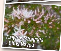
Calytrix tetragona