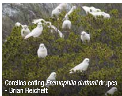
Corellas eating Eremophila duttonii drupes - Brian Reichelt

Rainbow Bee-eaters were sighted on 17th October and a huge flock of Little Corellas (c. 250+) has been feeding on the seed pods of the mulga trees, and other acacias, and also on Eremophila duttonii .