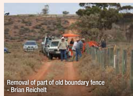
Removal of part of old boundary fence - Brian Reichelt