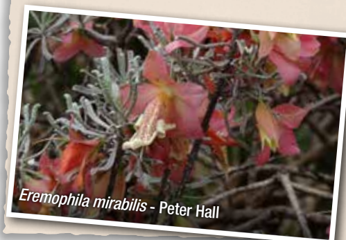
Eremophila mirabilis - Peter Hall

Eremophila mirabilis (mirabilis meaning wonderful, extraordinary) refers to its grey, warty leaves, and its unusual, coloured flowers. The flowers are a butter-yellow with reddish-purple spots. Eremophila mirabilis will grow to about 1.5 metres in height. It is very hard to propagate, the most suitable method being grafting. It's a good plant to grow in a pot. Eremophila mirabilis grows naturally in Western Australia.