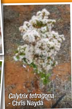
Calytrix tetragona