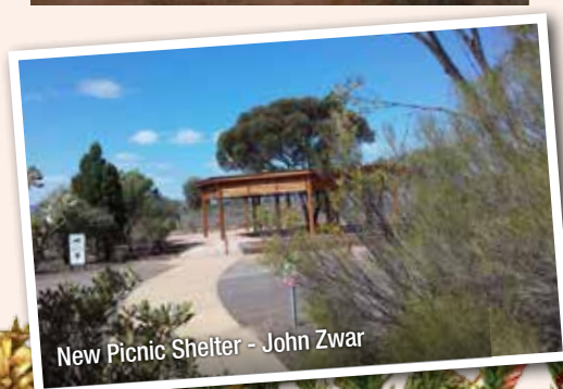
New Picnic Shelter