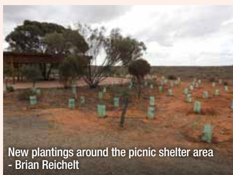
New plantings around the picnic shelter area - Brian Reichelt