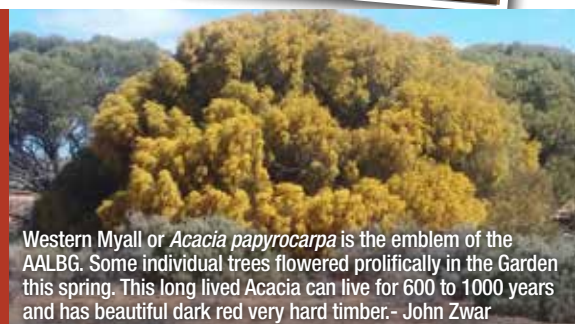
Western Myall or Acacia papyrocarpa is the emblem of the AALBG. Some individual trees flowered prolifically in the Garden this spring. This long lived Acacia can live for 600 to 1000 years and has beautiful dark red very hard timber. - John Zwar

Discounts for the purchase of meals and gifts in the café and gift shop only apply to the Friends Membership card holder/s and cannot be transferred to family and friends who are not members.