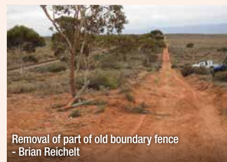
Removal of part of old boundary fence - Brian Reichelt