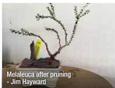
Melaleuca after pruning