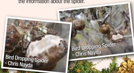
Bird Dropping Spider - Chris Nayda

Calytrix tetragona is an Australian native shrub commonly called Fringe-myrtle. It grows across many parts of southern Australia in high and low rainfall areas. When in flower it's a spectacular plant.