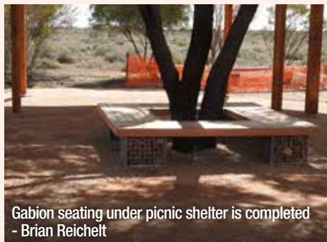
Gabion seating under picnic shelter is completed - Brian Reichelt

The picnic shelter construction is completed, and the surrounding area has been planted with around 120 plants as part of the landscaping of the area. The planting was sponsored by Northpoint Toyota as part of their Landcare involvement and children from the area were invited to come along and plant the trees with assistance from Friends and Garden Staff. By the next Newsletter it is anticipated that table settings will have been installed under the shelter along with a drinking water bubbler with a dog watering point for travellers who have their dogs with them.