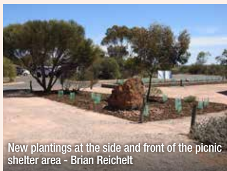
New plantings at the side and front of the picnic shelter area - Brian Reichelt