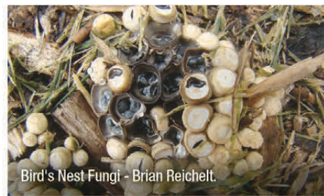
Bird's Nest Fungi - Brian Reichelt

With regard to the plants dying it was discovered that the plants were receiving only a light watering at least four times per week. Advice given to this person was to not water lightly as the water was not going deep enough to find the roots of the plants. A deep watering once per week of around 8 litres delivered by dripper would be much more desirable.