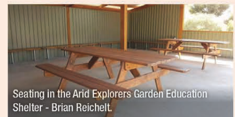
Seating in the Arid Explorers Garden Education Shelter - Brian Reichelt.

Garden Staff have constructed two large garden settings and wall seating in the large shelter of the "Arid Explorers Garden". These have been funded by The Friends.