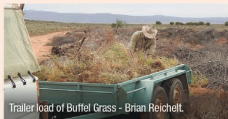
Trailer load of Buffel Grass - Brian Reichelt.

Buffel Grass control has continued with nine large tandem wheel trailer loads being removed from the Garden, and as the weather cools a concerted effort will be made to remove as much as possible. It has been found that digging the plants up and burying as per guidelines appears to be the best method to control this pest weed.