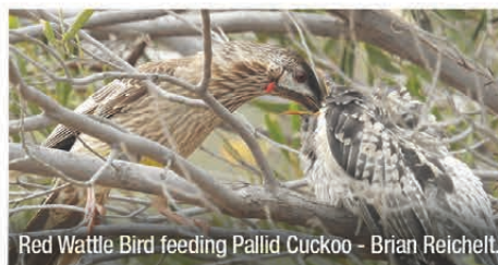
Red Wattle Bird feeding Pallid Cuckoo - Brian Reichelt.

On Saturday 30th September 2017, near the Courtyard, a fledgling Pallid Cuckoo was seen being fed by a pair of Red Wattle Birds ( Anthochaera carunculata ). Pallid Cuckoos usually parasitise some of the smaller Honeyeaters, like the White-plumed ( Ptilotula penicillata ) and the Singing ( Gavicalus virens ), but this time they chose as foster parents the Red Wattle Birds which are much larger than the other Honeyeaters.