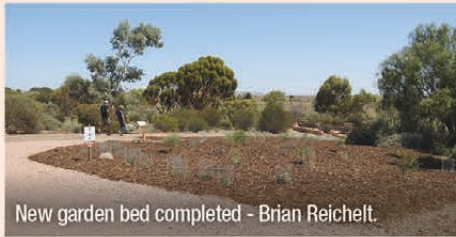
New garden bed completed - Brian Reichelt.

Buffel Grass control has continued with nine large tandem wheel trailer loads being removed from the Garden, and as the weather cools a concerted effort will be made to remove as much as possible. It has been found that digging the plants up and burying as per guidelines appears to be the best method to control this pest weed.