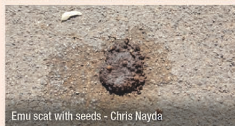
Emu scat with seeds - Chris Nayda