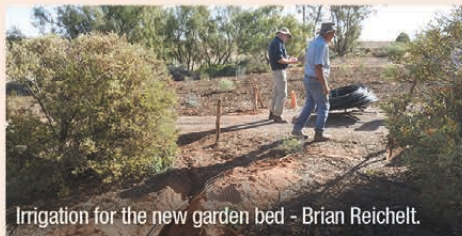
Irrigation for the new garden bed - Brian Reichelt.

A new garden bed has been created with Friends assisting Garden Staff in laying irrigation pipe, planting and mulching of the garden. This area is on the path to the Arid Smart Gardens.