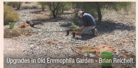
Upgrades in Old Eremophila Garden - Brian Reichelt.

Garden Staff have constructed two large garden settings and wall seating in the large shelter of the "Arid Explorers Garden". These have been funded by The Friends.