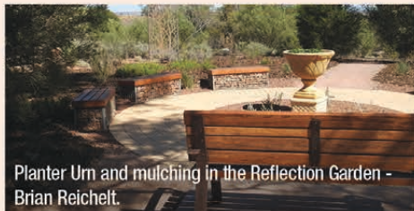
Planter Urn and mulching in the Reflection Garden - Brian Reichelt.

The outside work Volunteers started off slowly this year due to outside temperatures being quite high, up to 48 Celsius. However, as the weather commenced cooling, Garden work recommenced. The Reflection Garden has received an upgrade with mulching and also a large Plant Urn installed in the centre of the Garden. The cost of this Planter was donated by The Friends.