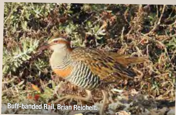
Buff-banded Rail, Brian Reichelt.

Buff-banded Rails feed on insects, small molluscs, invertebrates and some vegetable matter and seeds.