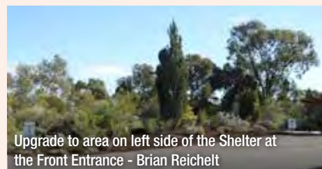
Upgrade to area on left side of the Shelter at the Front Entrance - Brian Reichelt

Plants at the Matthew Flinders Redcliff Lookout have been pruned and the whole area has received new mulch to improve the appearance of this area, and it is anticipated that by the end of November 2017 a new shelter will be erected over the top of the existing picnic table area. This will enable visitors to this area of the Garden to sit and enjoy the views of the Spencer Gulf whilst enjoying a picnic.