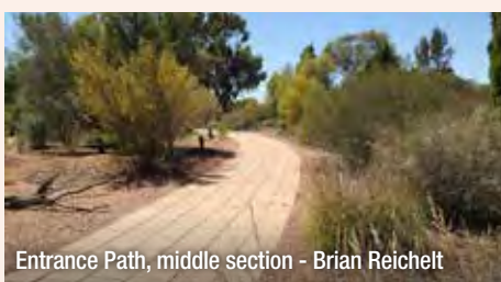
Entrance Path, middle section - Brian Reichelt