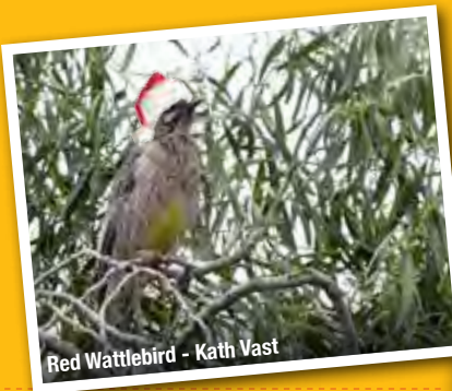
Red Wattlebird - Kath Vast

Sunday 3rd December 2017 - Australian Arid Lands Botanic Garden. Meet in the Car Park, 7:30 am Christmas Lunch in Café afterwards.