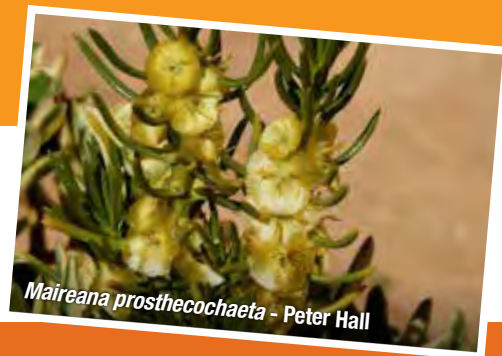
Maireana prosthocochaeta - Peter Hall

Maireana prosthocochaeta grows naturally in Western Australia in the area between Wiluna and Newman. It grows on hills and salty areas, to about 0.75 x 0.75 metres. Maireana prosthocochaeta is a relative of our Maireana sedifolia (Pearl Bluebush) that grows commonly around Port Augusta and inland Australia. We have Maireana prosthocochaeta growing in our home garden and it is quite spectacular with its large, bright yellow, fruiting perianths.