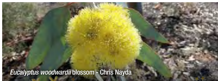
Eucalyptus woodwardii blossom - Chris Nayda