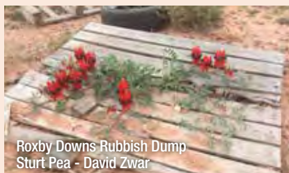
Roxby Downs Rubbish Dump Sturt Pea

Plant Sales: This last quarter Friends Volunteers assisted at out-of town plant sales and therefore made a valuable contribution to the monies raised by Council at Kadina: $1328 and Paskeville: $4300.