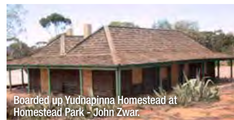
Boarded up Yudnapinna Homestead at Homestead Park