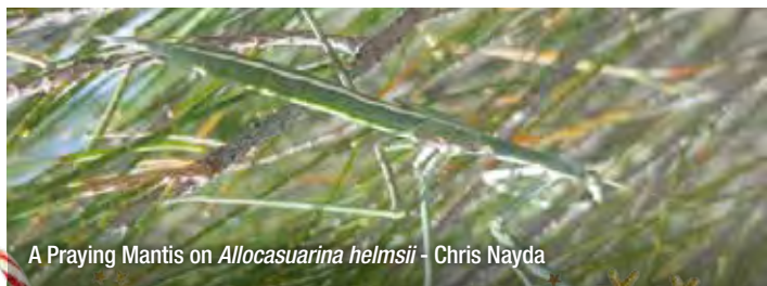
A Praying Mantis on Allocasuarina helmsii