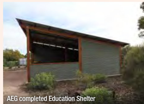
AEG completed Education Shelter

The Arid Explorers Garden is being very well patronised by local and out of town children and their parents and guardians. We have completed the large education shelter building, only to finalise seating in this area; installed rubbish collection bins to encourage recycling from the children; the timber work on the seats, bridges and first shelter have been re oiled to aid preservation of the timber; and some path restoration work has also been undertaken.