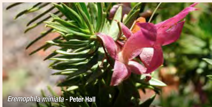
Eremophila miniata - Peter Hall

Several Eremophila miniata plants can be found growing in the new Eremophila Garden at the AALBG. These plants have been grafted. They seem to graft readily but are difficult to strike.