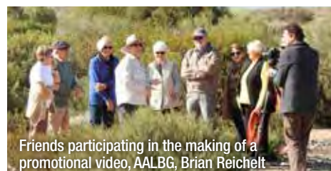
Friends participating in the making of a promotional video