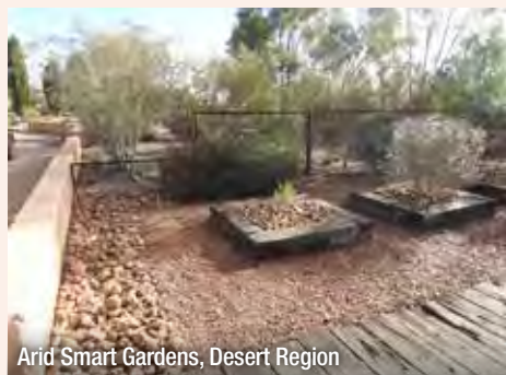
Arid Smart Gardens, Desert Region

Refurbishment of the Arid Smart Gardens has begun, with upgrading the dripper system and commencement of new plantings. The desert region garden is now completed and the other four gardens have received a cleaning up and pruning, however, they are still to undergo dripper system upgrade and new plantings.