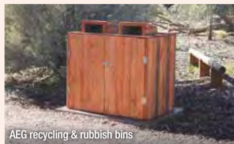
AEG recycling & rubbish bins

Also on the work programme is the upgrading of the Flinders lookout area with upgraded irrigation, plantings with plants specific to the Robert Brown collection and refurbishing the mulch.