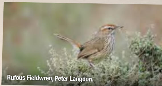
Rufous Fieldwren, Peter Langdon.

The "rufous" refers to the rich, chestnut cap and lower back and tail of the species, especially good in the local birds.