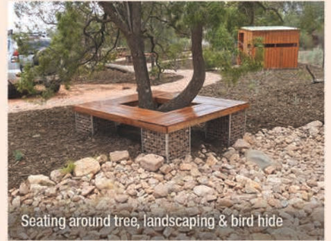
Seating around tree, landscaping & bird hide