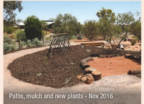
Paths, mulch and new plants - Nov 2016