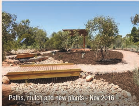
Paths, mulch and new plants - Nov 2016