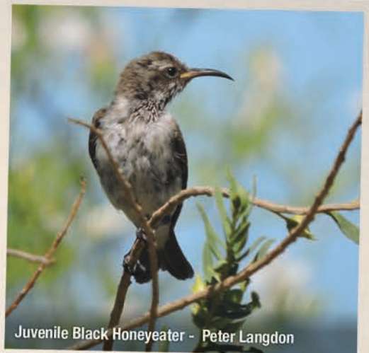
Juvenile Black Honeyeater - Peter Langdon

There are a few Yellow-rumped Thornbills watering at the Chenopod bird hide, but you must get there early to see them.