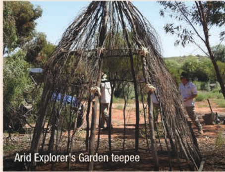
Arid Explorers's Garden teepee

We have also continued to be busy working in the Arid Explorers Garden, installing a Bird Hide, a Teepee structure (see photo), and undertaking further landscaping.