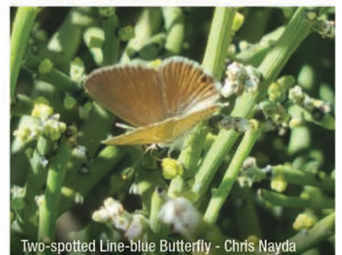
Two-spotted Line-blue Butterfly

To have them in your garden just plant a couple of wattle trees and they will come and see you.