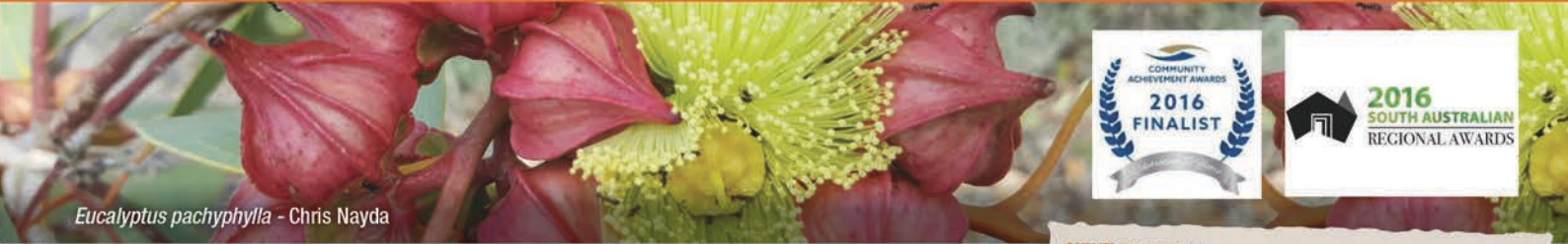
Eucalyptus pachyphylla - Chris Nayda