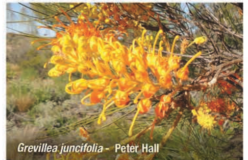
Grevillea juncifolia - Peter Hall

In South Australia Grevillea juncifolia grows in the northwest of the state, with some plants on Eyre Peninsula. The photos used in this article were taken on the Lasseter Highway west of Erdunda in the Northern Territory.