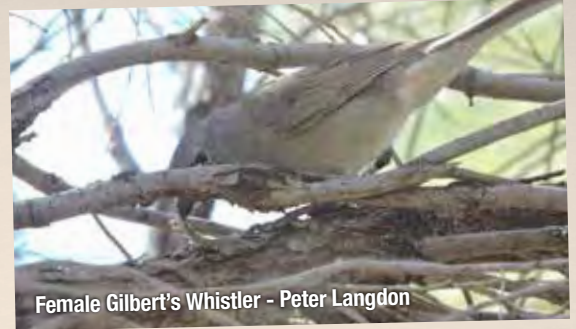
Female Gilbert's Whistler

This bird was named after John Gilbert, who was John Gould's (the birdman) most prolific collector of bird specimens and who discovered many new species in Australia, including the Paradise Parrot (now believed extinct). Gilbert was supposedly speared to death by Aborigines on Ludwig Leichardt's expedition to Port Essington (near Darwin) in 1845.