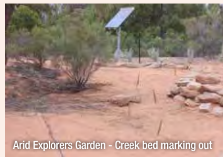
Arid Explorers Garden - Creek bed marking out