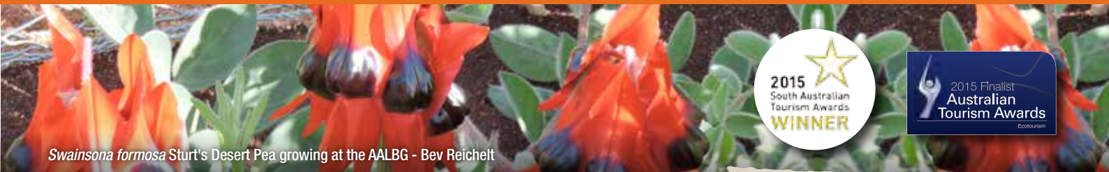
Swainsona formosa Sturt's Desert Pea growing at the AALBG - Bev Reichelt