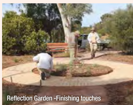
Reflection Garden - Finishing touches