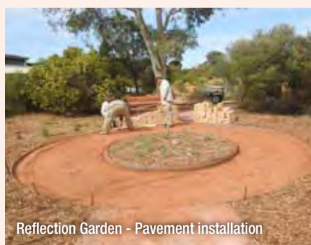
Reflection Garden - Pavement installation