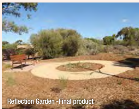
Reflection Garden - Final product

The Arid Explorers Garden, is progressing well with the area cleared of unwanted vegetation, the maintenance path installed, the rock retaining wall on the dry creek bed installed and the stones laid to form the dry creek bed. Thank you to Dr. Anu for donating the large stones used for the wall of the creek.