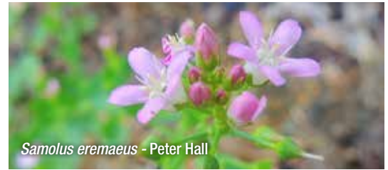
Samolus eremaeus

Samolus eremaeus grows in S.A., W.A. and N.T. and often in sandy or gravelly soils near creeks and pools. The name eremaeus means, growing in deserts. It belongs to the Primulaceae family.