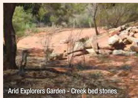
Arid Explorers Garden - Creek bed stones