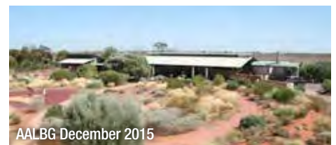
AALBG December 2015