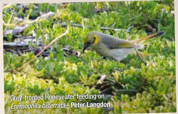
Grey-fronted Honeyeater feeding on Eremophila biserrata - Peter Langdon

The attached photo is of the Grey-fronted Honeyeater in the Garden, feeding on the flowers of the Eremophila biserrata .