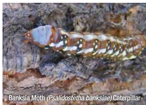
Banksia Moth ( Psalidostetha banksiae ) Caterpillar

Native Blue-banded Bee on Eremophila mackinlayi .