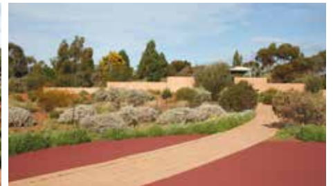
July 2015 Poached- Egg Daisies thrive in the Annuals Bed.