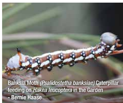
Banksia Moth ( Psalidostetha banksiae ) Caterpillar feeding on Hakea leucoptera in the Garden - Bernie Haase