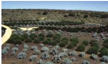
Approx. 1999 First plantings grow displaying alternating rows of contrasting colours.