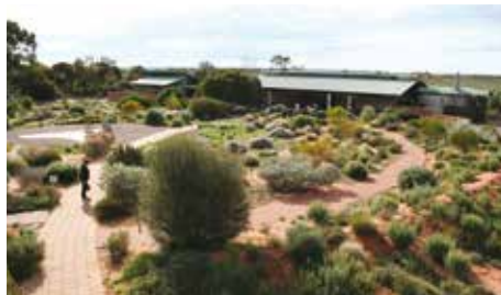
July 2015 The re-developed Courtyard.