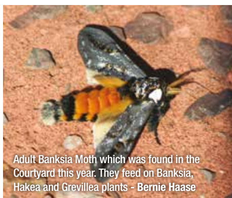
Adult Banksia Moth which was found in the Courtyard this year. They feed on Banksia, Hakea and Grevillea plants