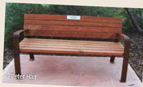
- Peter Hall

The Friends Committee is looking for more donors for provision of a further 14 garden bench seats. $700 provides the bench, the plaque (recognising either the donor or in memory of a loved one) and the concrete footing. If you can see your way clear to donate to this worthy cause it would be greatly appreciated. Please note that these donations are deemed to be tax deductible and that tax deductible receipts are issued.