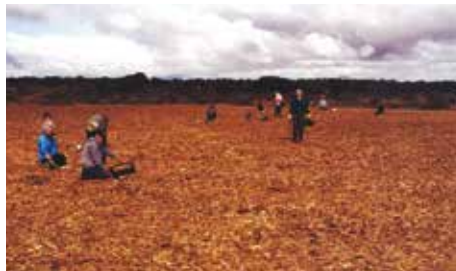
June 1996 First plantings in the mulched Courtyard.

The Courtyard currently showcases numerous species of plants that grow in sand.