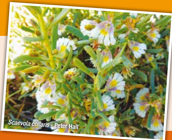
Scaevola collaris - Peter Hall

Scaevola collaris likes to grow in well-drained, sandy soil and can be found growing near salt lakes at times. The name Scaevola comes from Latin, meaning left-handed, and refers to the one-sided flowers that all scaevolas have.