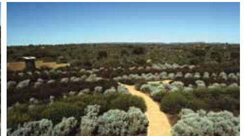
Approx. 2002 First plantings of Eremophila and Bluebush mature further.